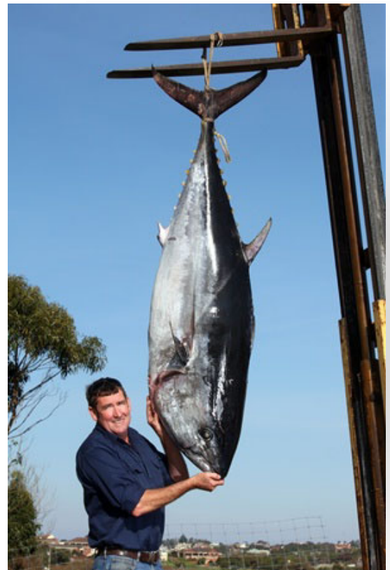
The Prez shows of the 138kg tuna he caught off Warrnambool